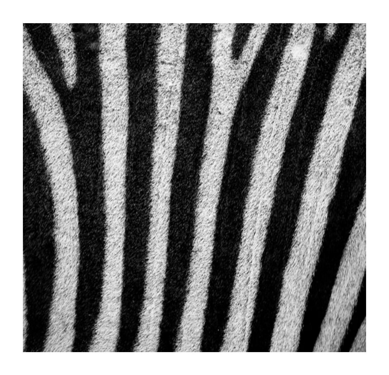
Hair or Fur