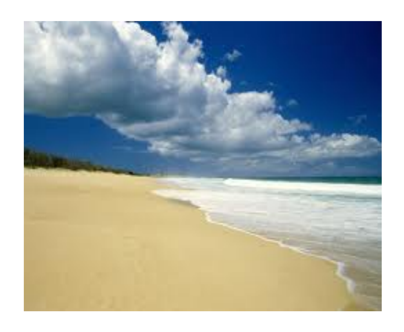
Animals that live on land and in the water